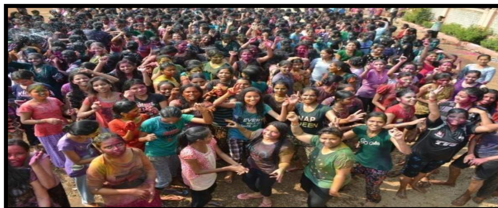
Celebration of HOLI

The carefree festival filled with fun and frolic is celebrated with enthusiasm and loved by all. Well! Holi is a festival that is celebrated in different ways in different parts of the country. Before the lighting of the bonfire a pooja is performed by the women for the prosperity of their family and good health of their children. On the eve of Holika Dahan people gather together beating drums, singing and dancing around the bonfire then they light it. This day marks the end of evil just like the end of Holika, the sister of the demon king Hiranyakashyap who was destroyed in the fire.