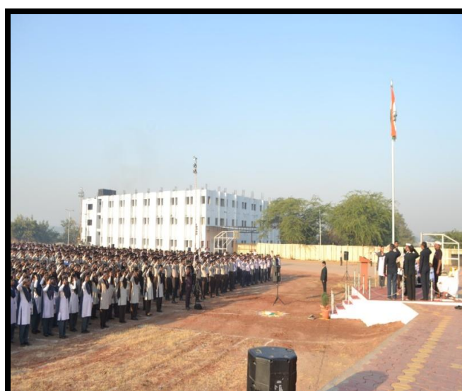
Celebration of Republic Day