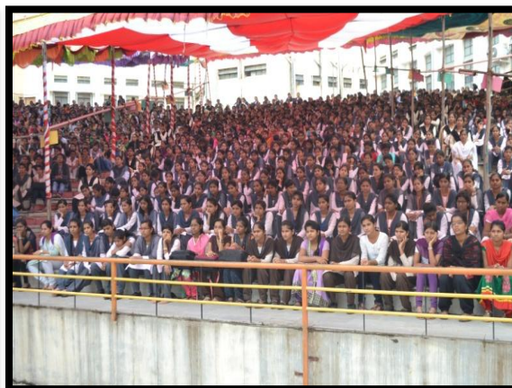
Celebration of Engineer's day