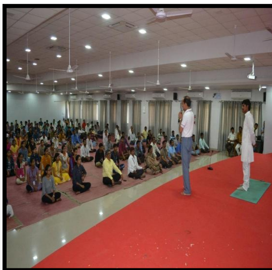
Celebration of Yoga Day