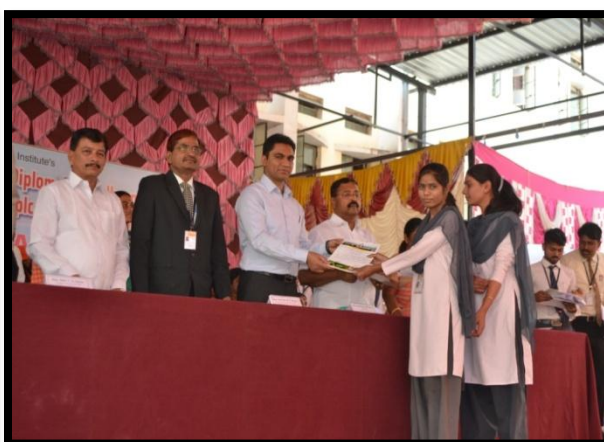
Celebration of Women's Day