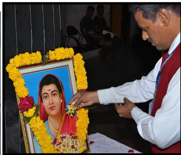
Celebration of Savitribai Phule Jayanti