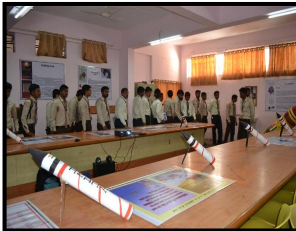
Celebration of Dr.Abdul Kalam Remembrance