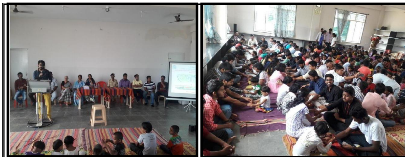
Celebration of Raksha-bandhan at “Palavi NGO”

From last three years MESA has celebrated Raksha-bandhan at Palvi NGO. For this celebration we have collected some contribution from our mechanical students and from faculty members. From that contribution we have purchased some foods, Sweets, stationary as per request from Palvi. On 7 th August 2017.We went to Palvi along with 130 students and 6 faculty members. Then we saw there some simple products like Rakhi which are created by the children’s. We have purchased that Rakshi from them by giving our contribution.