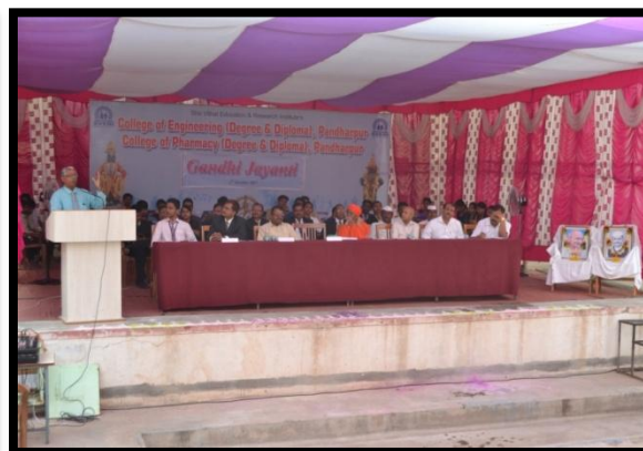
Celebration of Gandhi Jayanti & Lalbahadur Shastri Jayanti